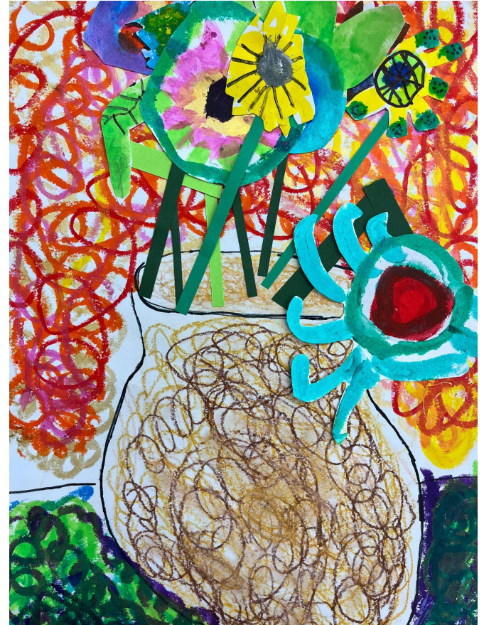
NPS Art by Alex, Grade 2

Our goal is to balance fiscal responsibility, strategic reductions, and budget-neutral solutions while preserving high-quality education and student-facing positions.